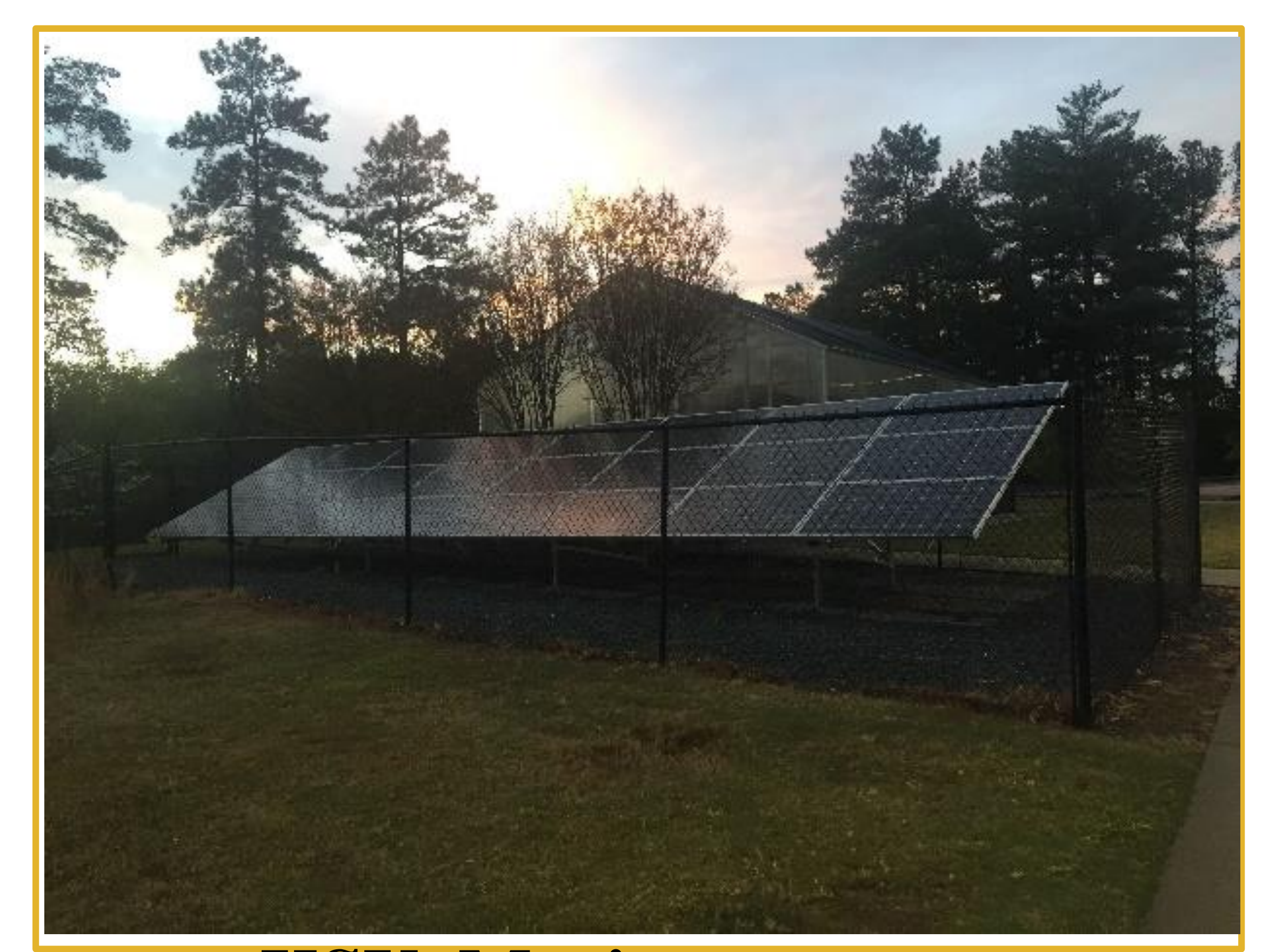
KSU, Marietta campus

• I calculated maximum value for solar irradiation and divided it by the electrical power that was captured by the solar panels on campus in order to derive the efficiency of the system. This "efficiency" directly affects the price of electricity. By increasing the amount of kW captured, the cost per unit of energy delivered decreases.