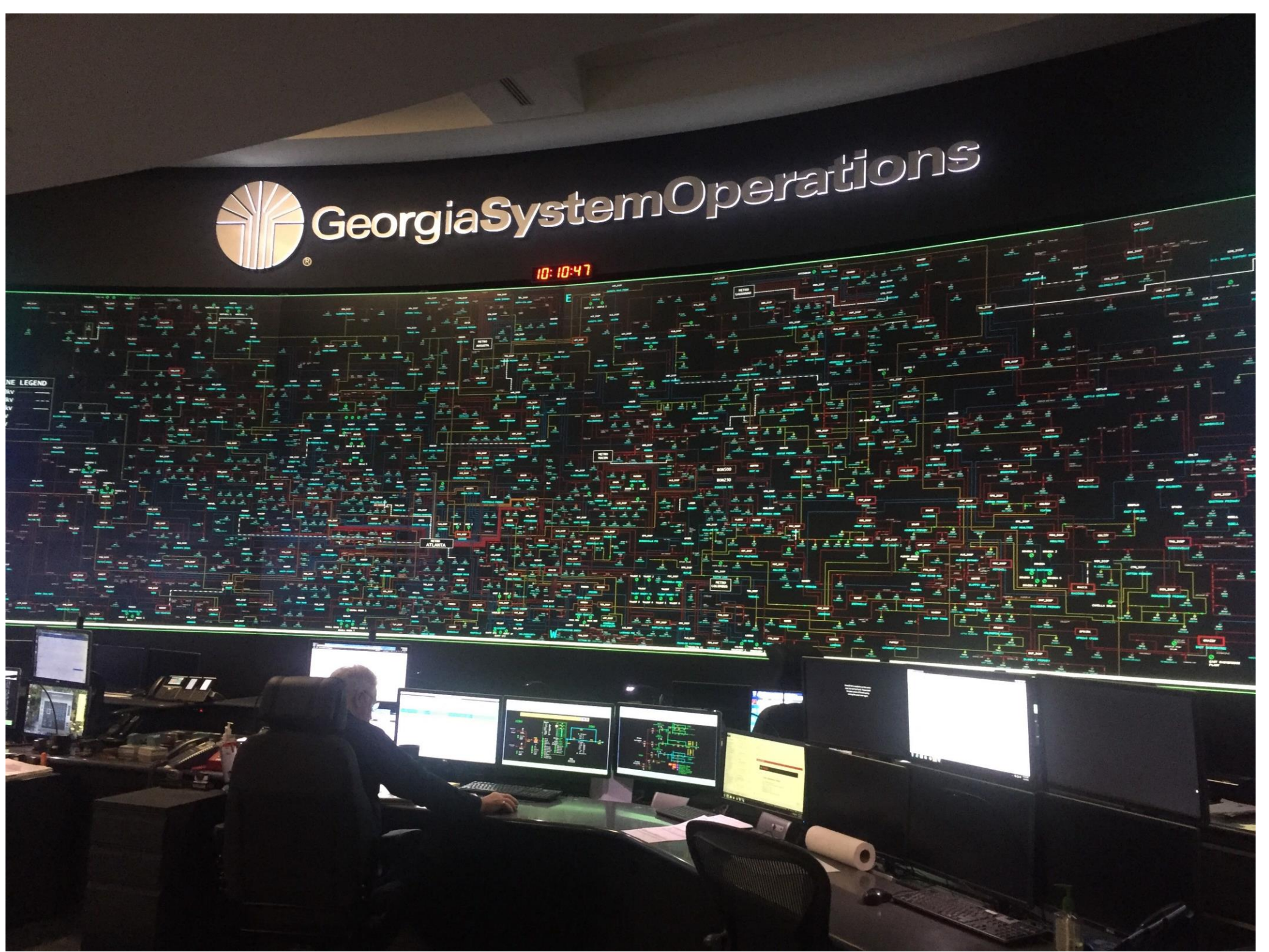
Georgia Transmission Corporation Site Tour:2 April, 2019